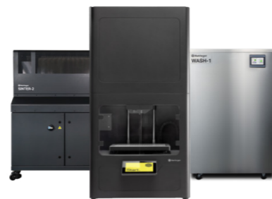
Markforged Metal X Gen 2