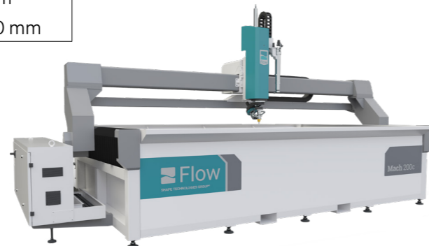
Performatec Mach 200C