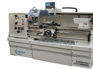
Colchester Triumph VS 2500