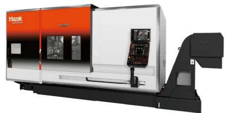
Mazak Integrex i-450HS

By reducing setup time and boosting efficiency, 5-axis machining is ideal for high-precision, multi-faceted projects.