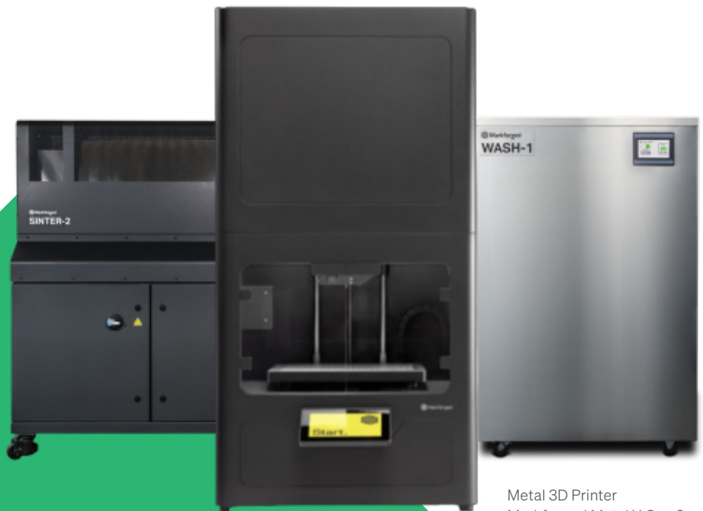
Metal 3D Printer Markforged Metal X Gen 2

Australian Government Department of Education