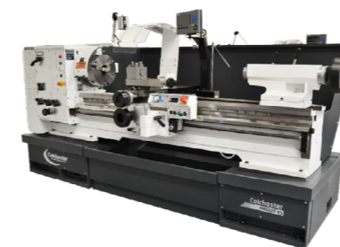
Colchester Mascot VS 2000