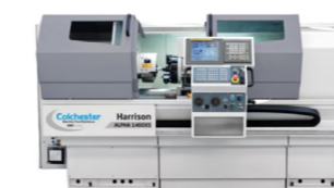
Colchester Alpha 1460XS