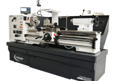
Colchester Master VS 3250